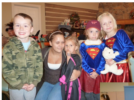
Our Harvest Party and 1st Thanksgiving photos!